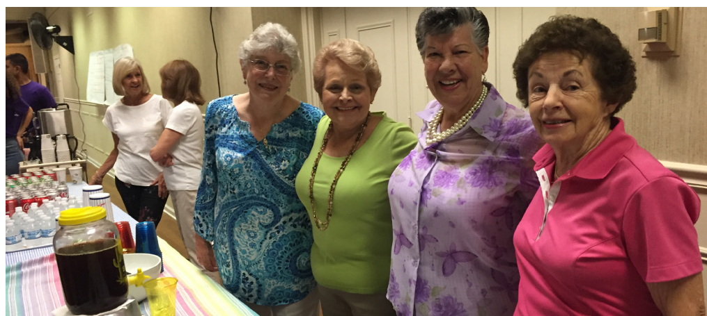
Women's Association Chapters 8 and 9